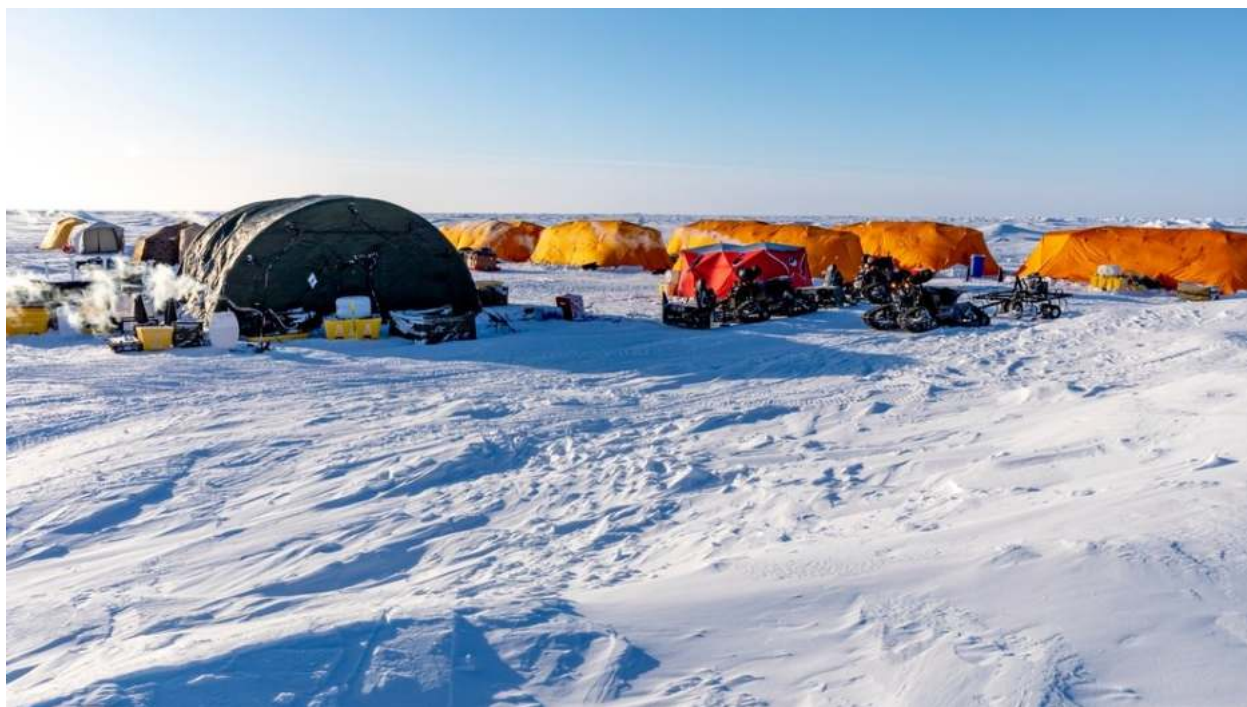
Operation Ice Camp 2024